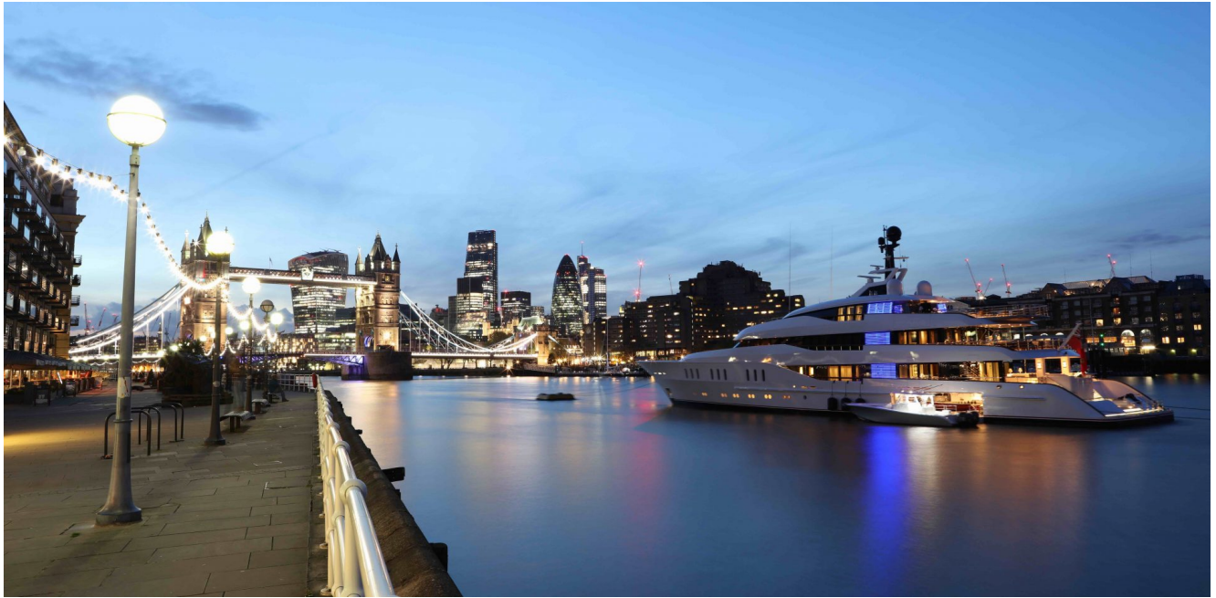
M/Y Vanish in Central London