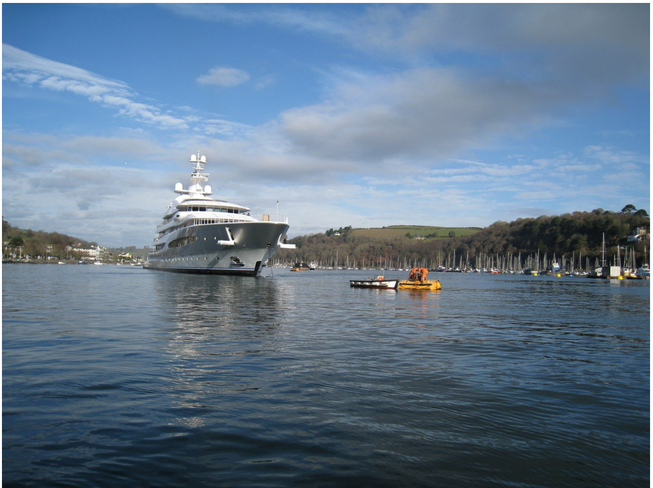
Mayan Queen in Dartmouth

Portsmouth, Dartmouth, Salcombe, Falmouth. Fowey and others offer not only stunning coastal scenery but some activity, culture and history unique to each area.