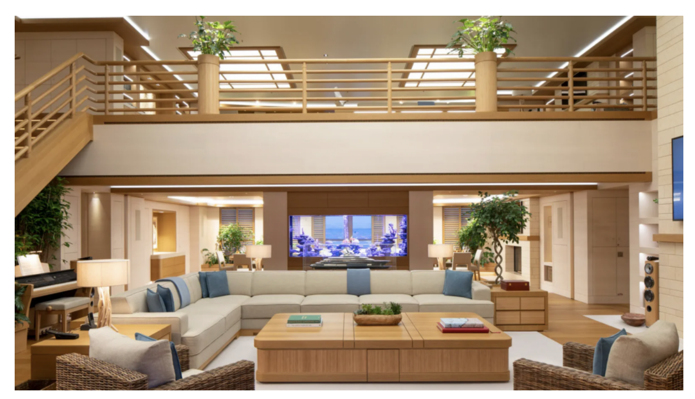
The leafy two-level saloon.

Bringing a sense of cosiness to the saloon is a real wood fireplace. It works like a typical fireplace, but with insulated ducts that route smoke up the mast with the help of forced extraction.