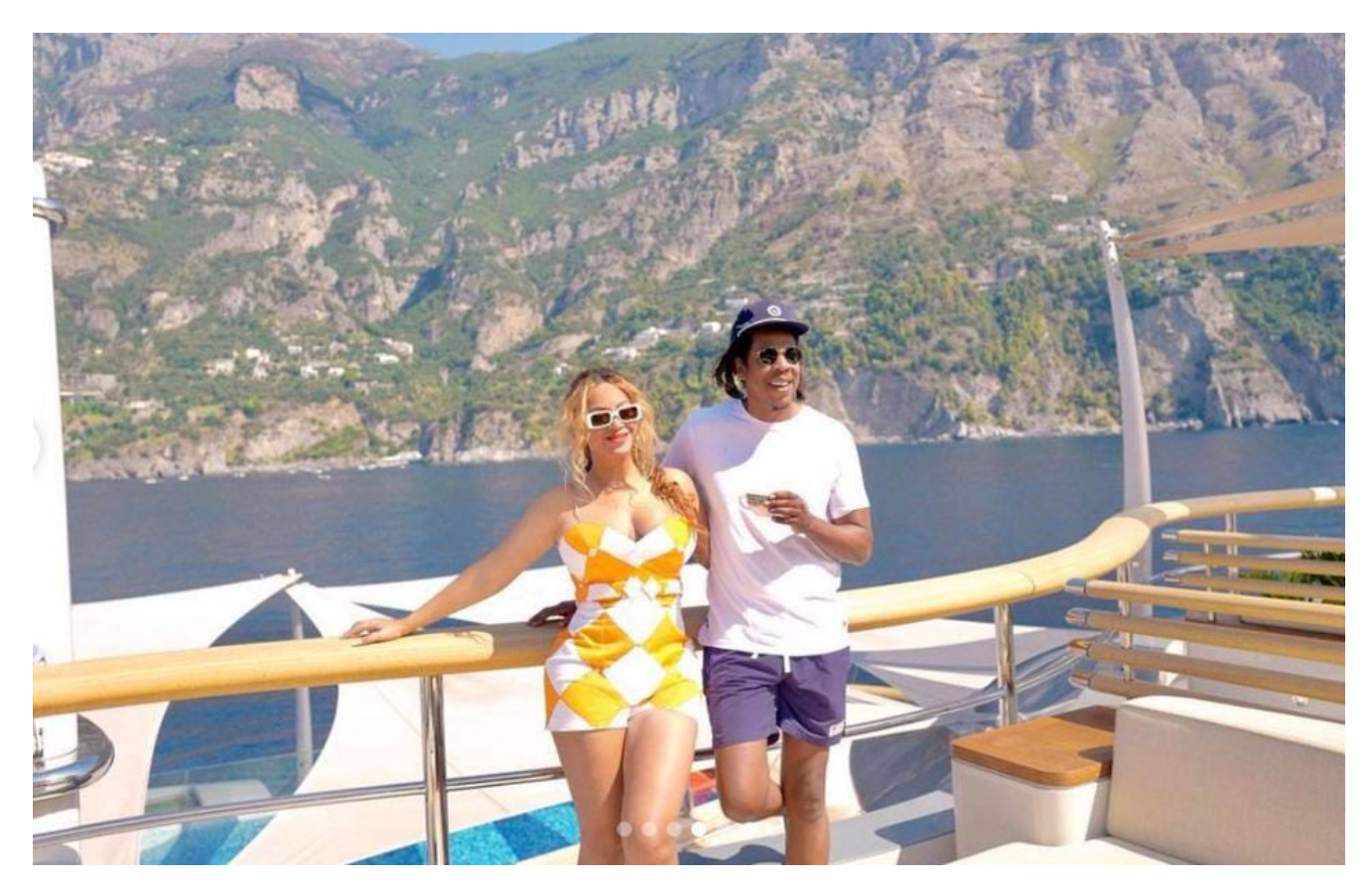
Beyonce and Jay-Z aboard Flying Fox