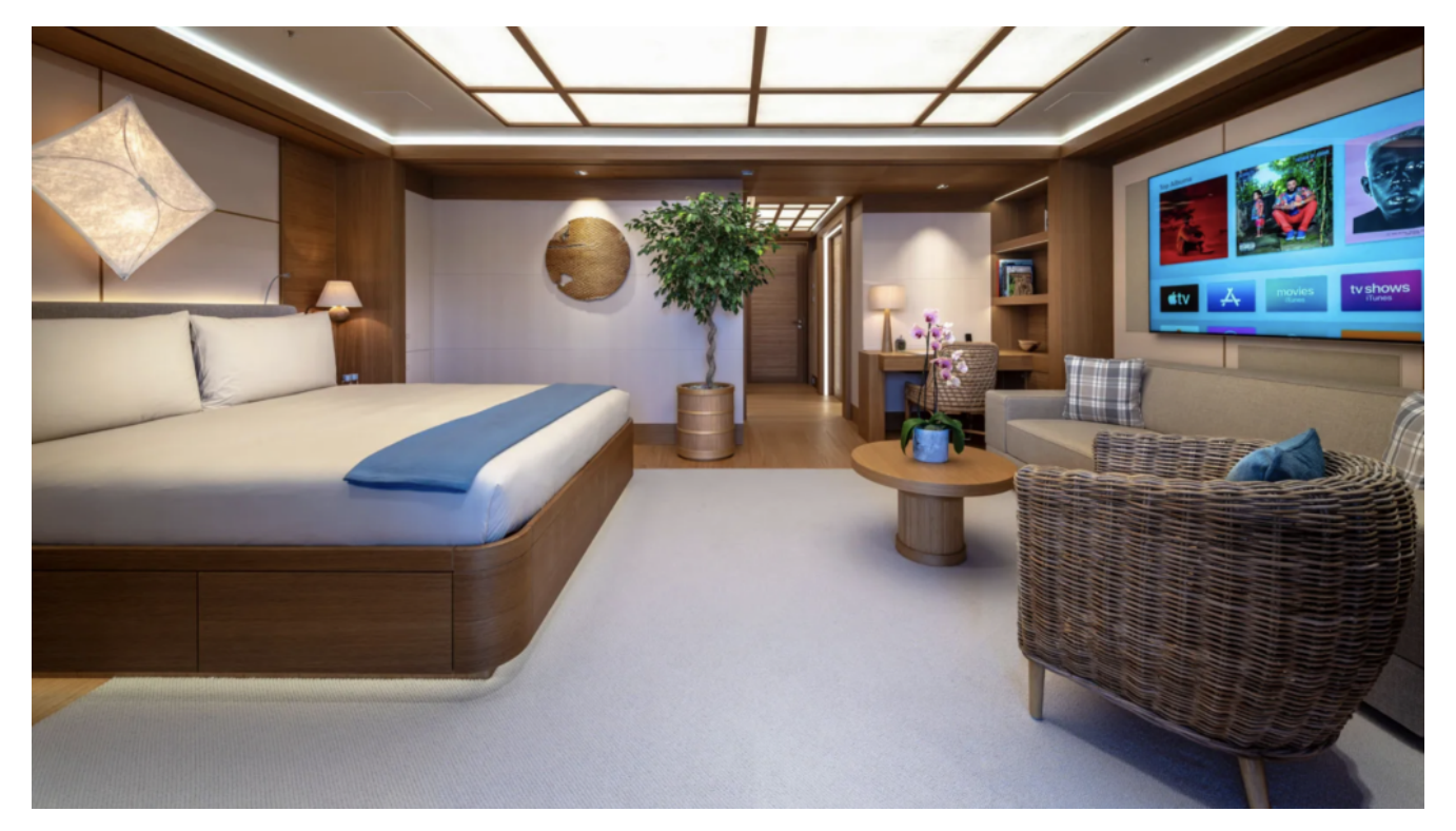
The spacious guest suites.

On the upper deck, the master suite is located. It continues following the same design sensibilities and embellishments found in the guest suites, creating a cohesive experience throughout the vessel. A 48-square-metre bathroom is centred with an oval bath and a large shower that are all spaced outboard for views through double-fronted sliding doors onto the vast private terrace that runs around the front of the suite.