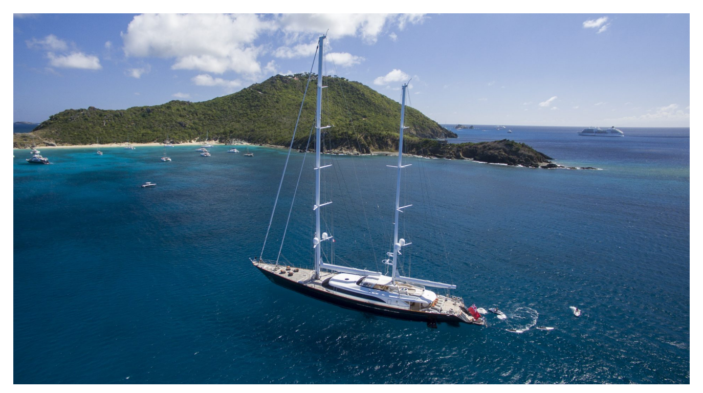
Y.CO have a wide selection of superyachts available for charter in the Caribbean this winter.

With a sandy cove for every day of the year, there's plenty of fun to be had for all the family in Antigua. Galley Bay's spectacular surf will attract the thrill seekers amongst the group, Pinching Bay is perfect for bringing everyone together for a festive beach barbecue, while the views at Half Moon Bay will inspire many an Instagram update come Christmas Eve.