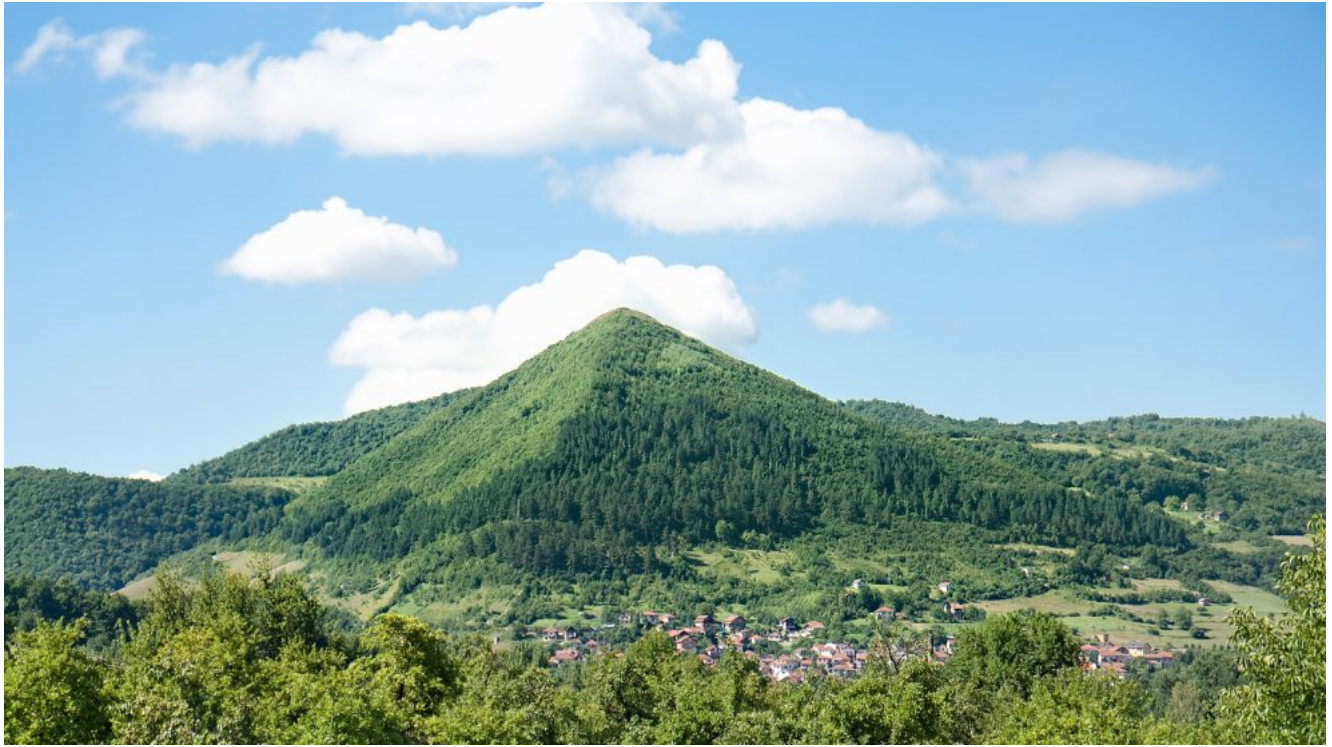
Bosnian Pyramids of Visoko