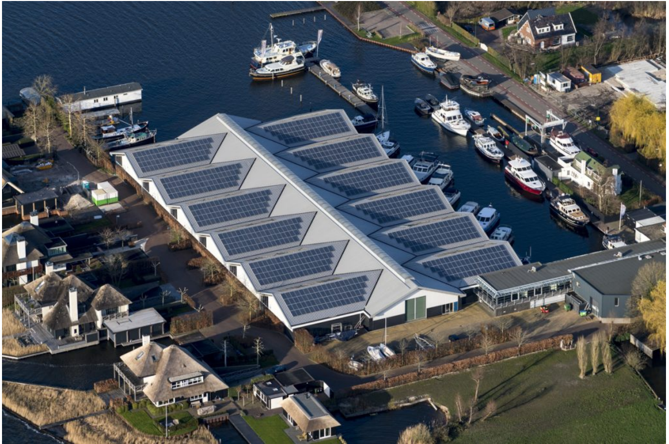
De Valk Loosdrecht