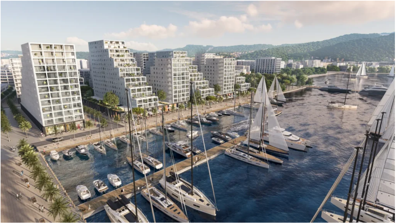
Marina Vlora design