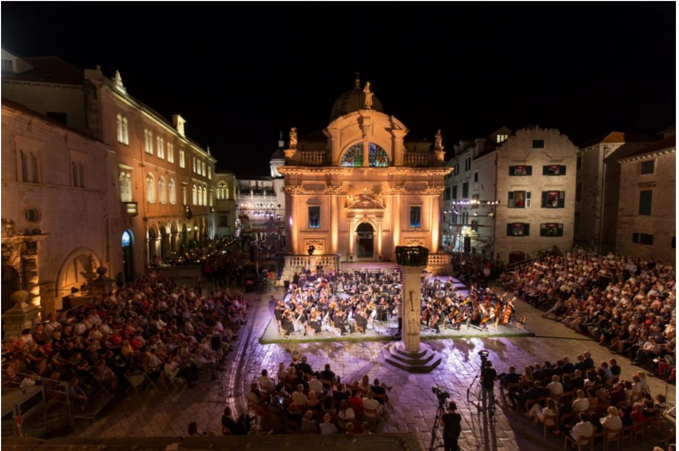
Dubrovnik Summer Festival