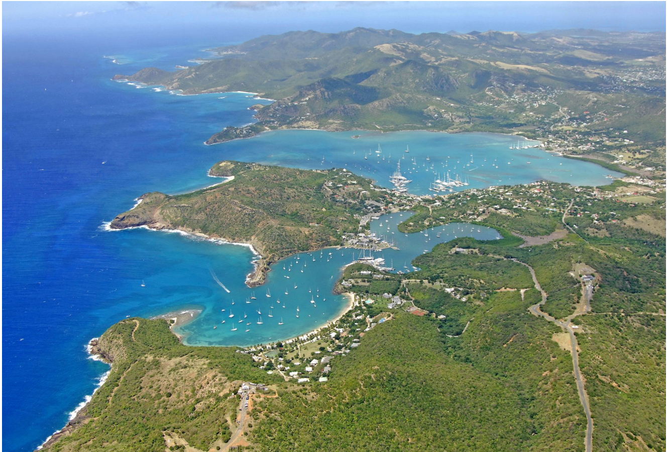
English Harbour Antigua

As the Caribbean season begins, many yachts will start making their way across the Atlantic. Wilsonhalligan recruits all year round for both the Mediterranean season (May-October) and the Caribbean season (November-April) – so this time of year is busy. For many yachties, the Caribbean season is something they look forward to, but what are the differences between the Med and Caribbean seasons, and what can yacht crew expect when they get there?