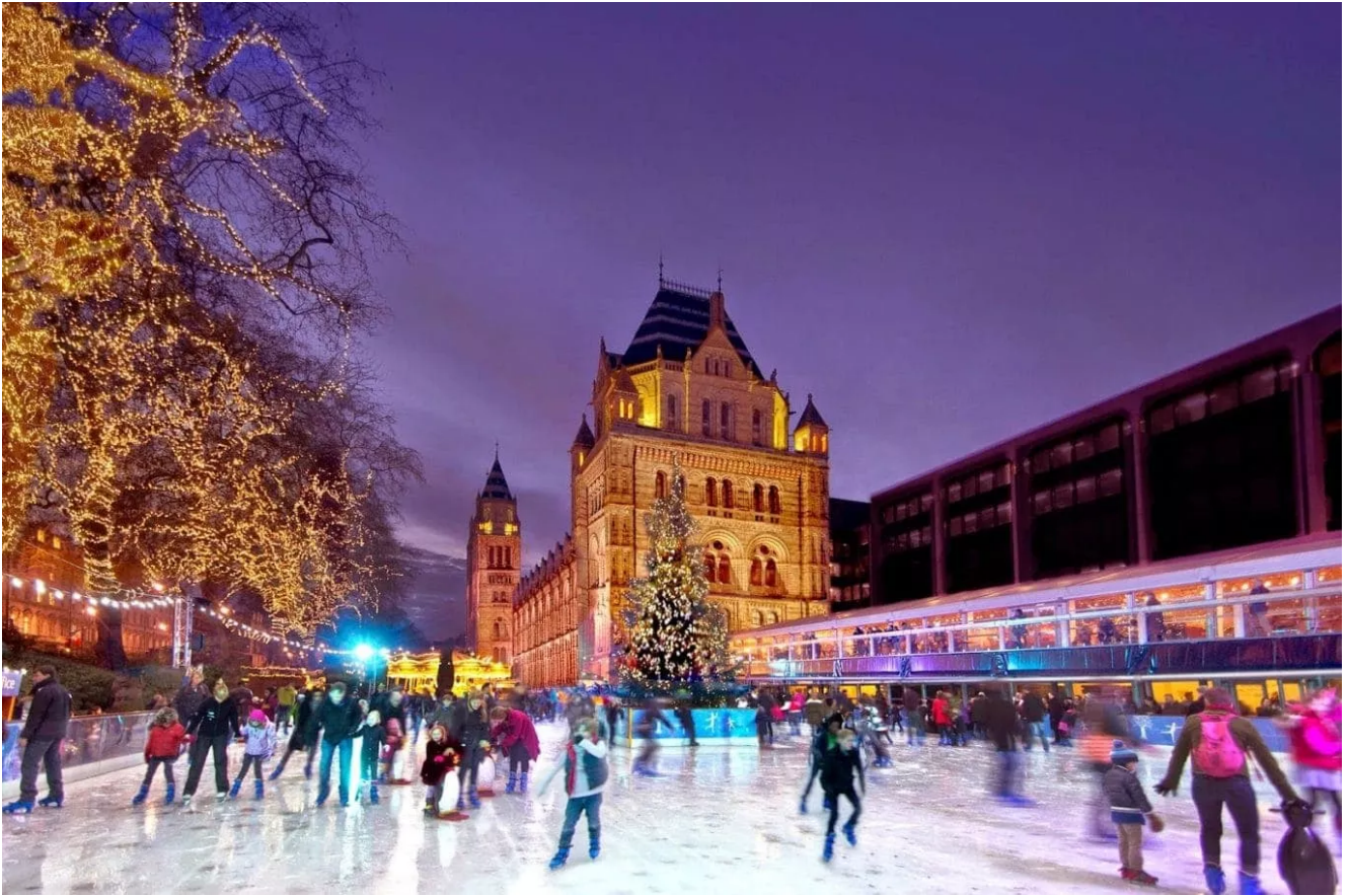
Natural History Museum Ice Rink

Not only will you get to witness one of London's most stunning feats of architecture while skating with your family, but you will also be able to take in some culture beforehand.