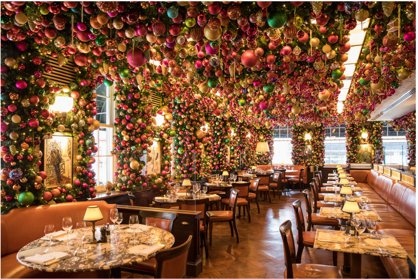
Miracle @ 34 Street

The ultimate Christmas dining experience, 34 Mayfair made a name for itself back in 2020 when it installed 14,000 decorations, including 8,400 glittering baubles, for guests to immerse themselves in while enjoying the exquisite cuisine.