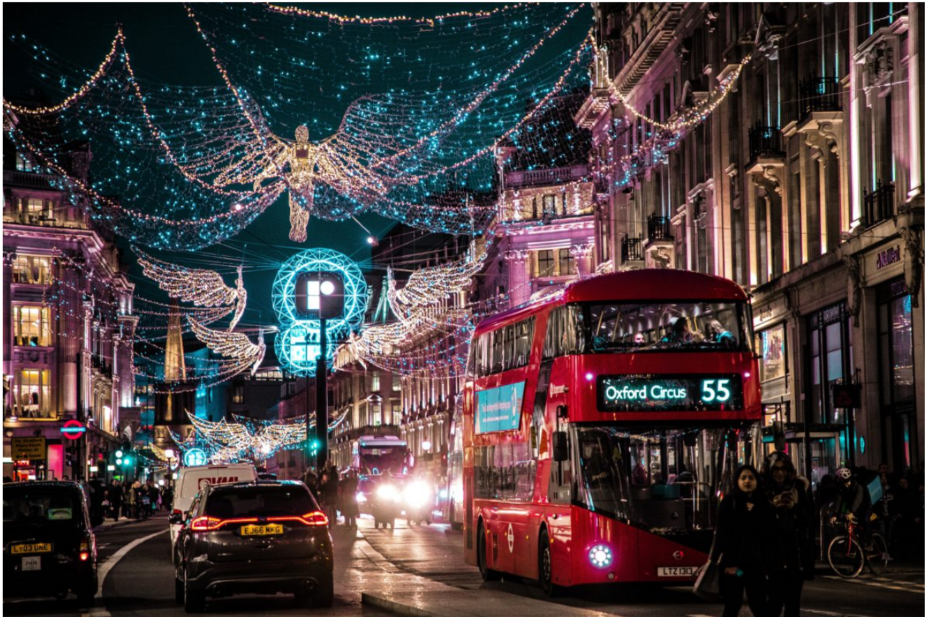
Christmas On London's Oxford Street

Christmas in London is an experience everyone should have. There was a time, not long ago, when London might have seemed a peculiar choice for a Christmas Superyacht destination, but those are days of the past. With all its celebrated landmarks, culture and not to mention the berth options right in the heart of the city, London is one of the best places to berth around Christmas and take in the fantastic festive atmosphere.