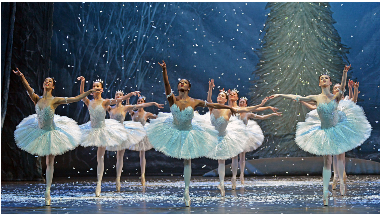
The Nutcracker At The London Coliseum

Tchaikovsky's masterpiece, brought to life by the English National Ballet, continues to be a festive treat for all the family, attracting thousands of theatre-goers every year.