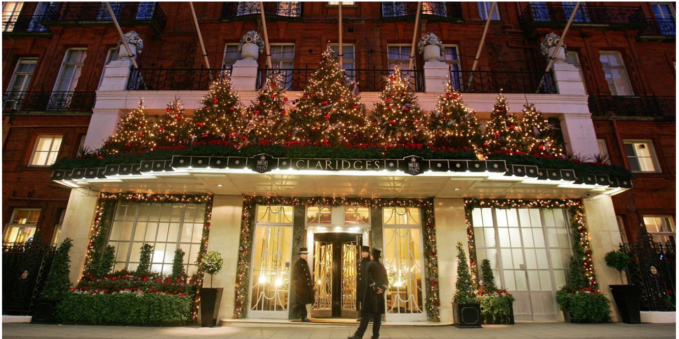
Claridge's Christmas Entrance

If it's fine dining you're after, you needn't look any further than the quintessential British cuisine at Claridge's. While you're there, you can also visit their world-famous Christmas tree, which takes on a different guise each year, courtesy of the world's best fashion houses.