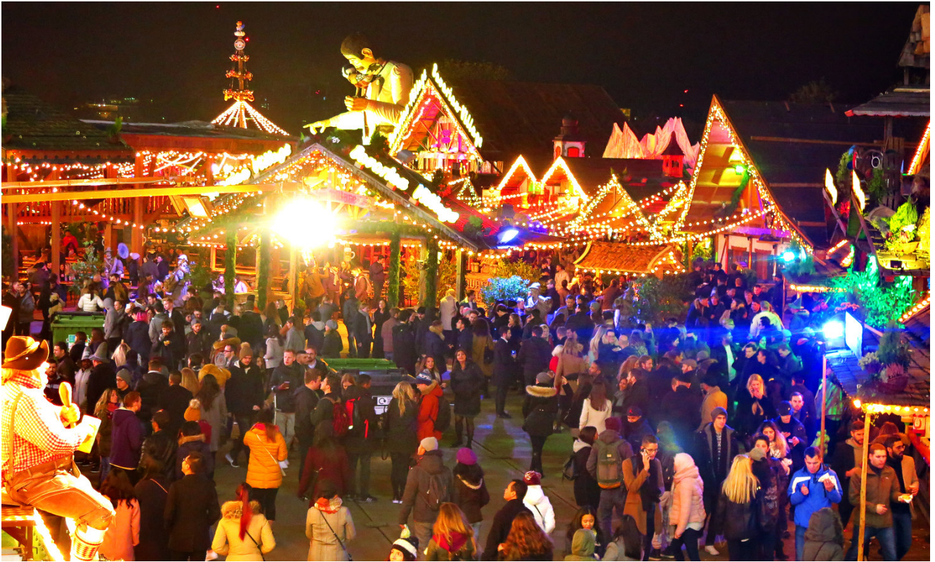
Winter Wonderland In Hyde Park

Winter Wonderland is widely considered the all-singing, all-dancing leader when it comes to London's Christmas markets. From fairy-tale ice kingdoms to Bavarian beer houses, all of the festive boxes can be ticked in this magical setting.