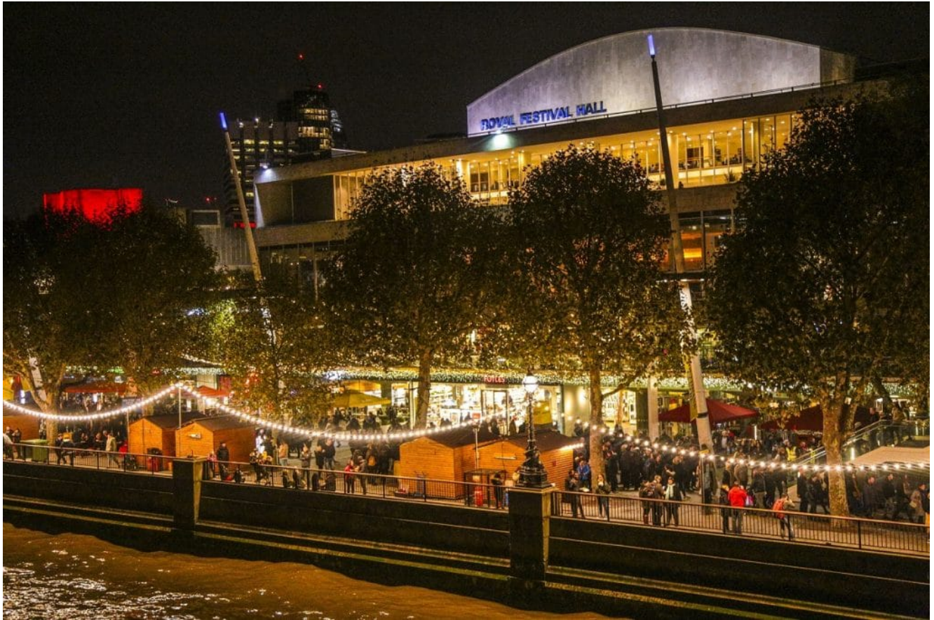
Southbank Christmas Market

One of best places to walk along the banks of the Thames, the Southbank offers a true taste of London atmosphere; never more so than at Christmas time, when it is adorned with a plethora of Christmas lights and market stalls.