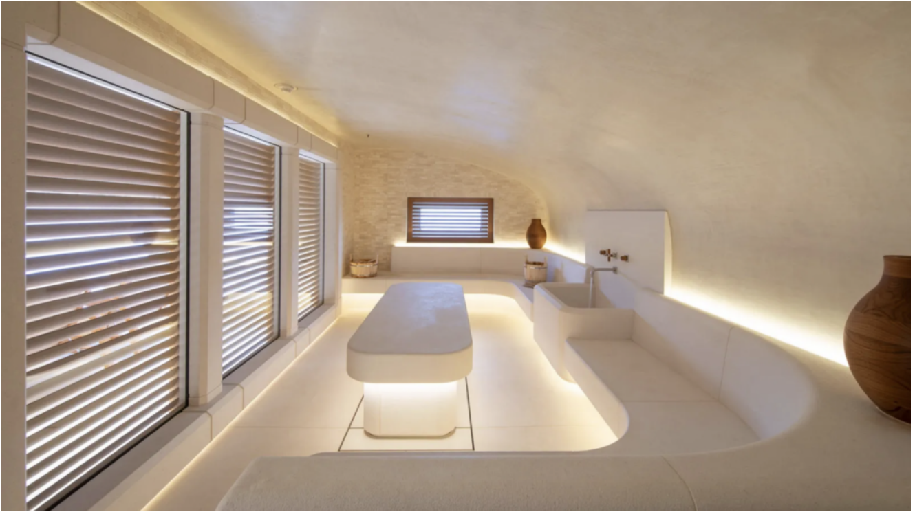
Flying Fox's calming Spa.

Perhaps the most breathtaking addition to the yacht is her spectacular pool. The 12-meter swimming pool, which runs transversely on the main deck, is a technological feat and a first for a superyacht of this size.