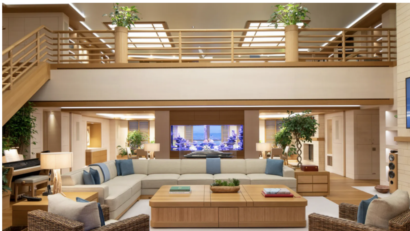
The leafy two-level saloon.

When it comes to social living spaces, the saloon found to Port on the Upper Deck is the perfect place for friends and family to gather. It's a leafy space, full of plants including two spectacular ficus trees. The lush plants are all on automated watering schedules to ensure they remain healthy. Bringing a sense of cosiness to the saloon is a real wood fireplace. It works like a typical fireplace, but with insulated ducts that route smoke up the mast with the help of forced extraction.