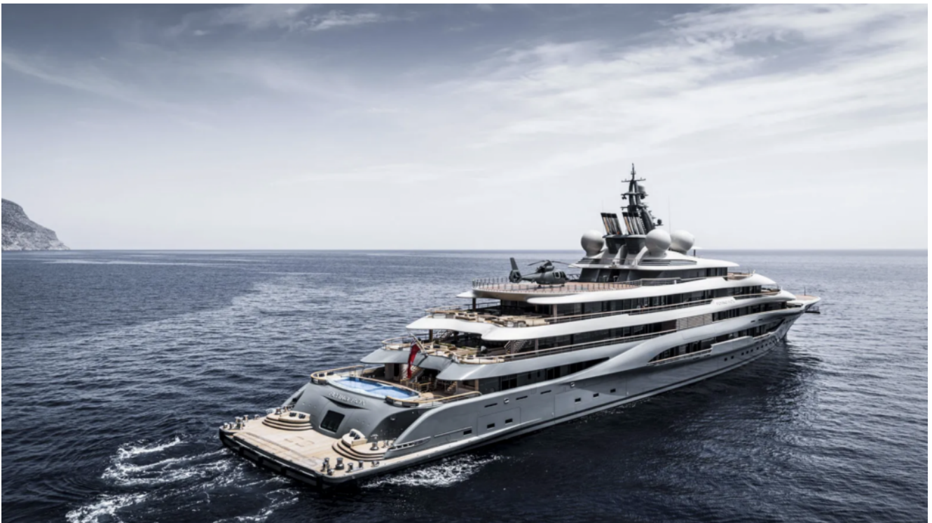
Flying Fox's stunning exterior.