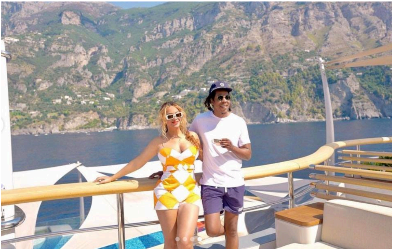
Beyonce and Jay-Z aboard Flying Fox

Rumoured to be owned by Amazon founder Jeff Bezos, Lurssen's superyacht Flying Fox is the largest charter yacht in the world. At 136m in length, it's a truly incredible vessel, reflected in the eye-watering €3,00,000 weekly charter price. Amongst guests chartering the yacht are the likes of Logan and Jake Paul, and Beyonce and Jay-Z, truly making it a yacht for the elites of the world. We are taking you on a top-to-bottom tour of the Flying Fox, covering everything from guest suites to the tender garage.