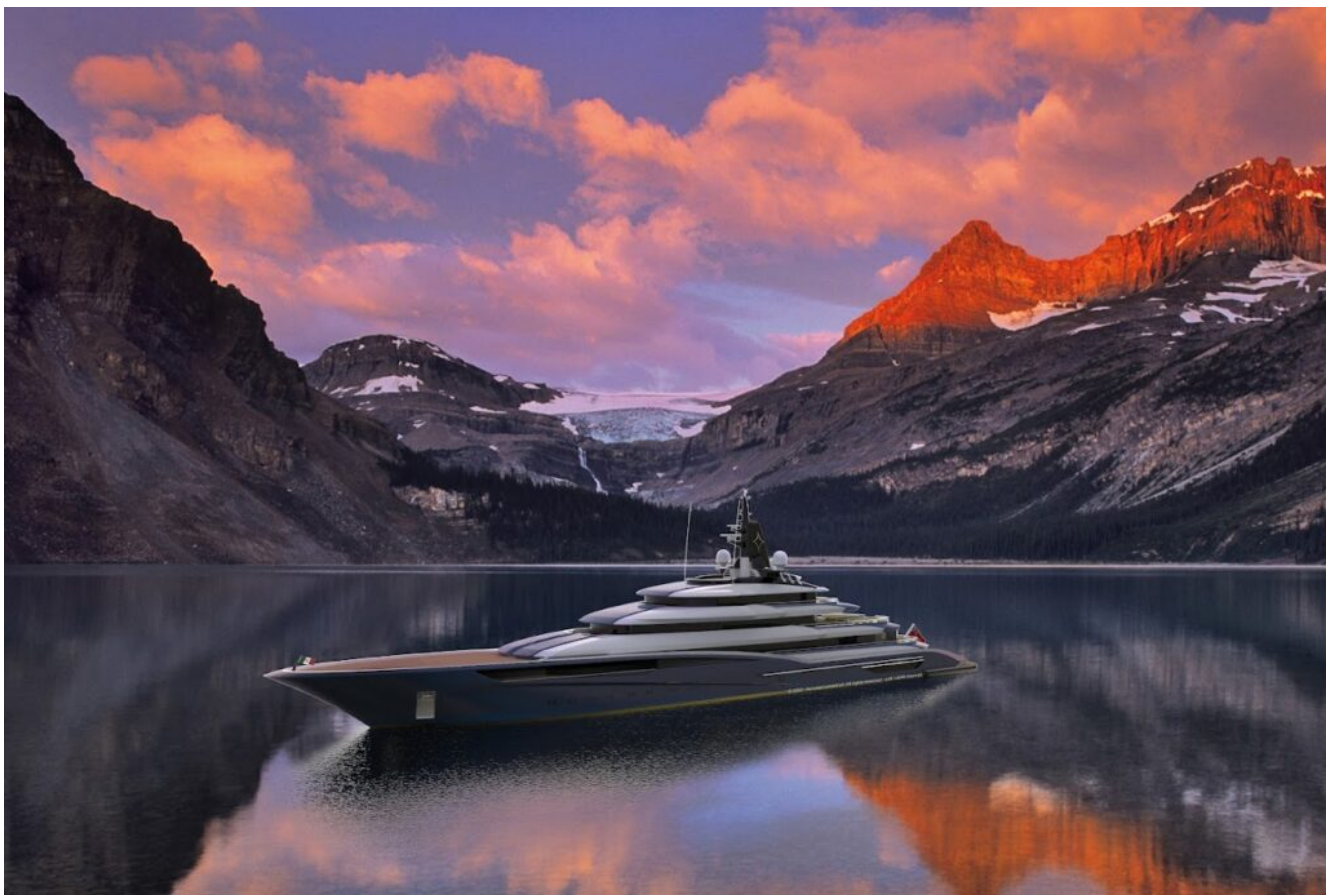
The exterior design of Project Amarcord.