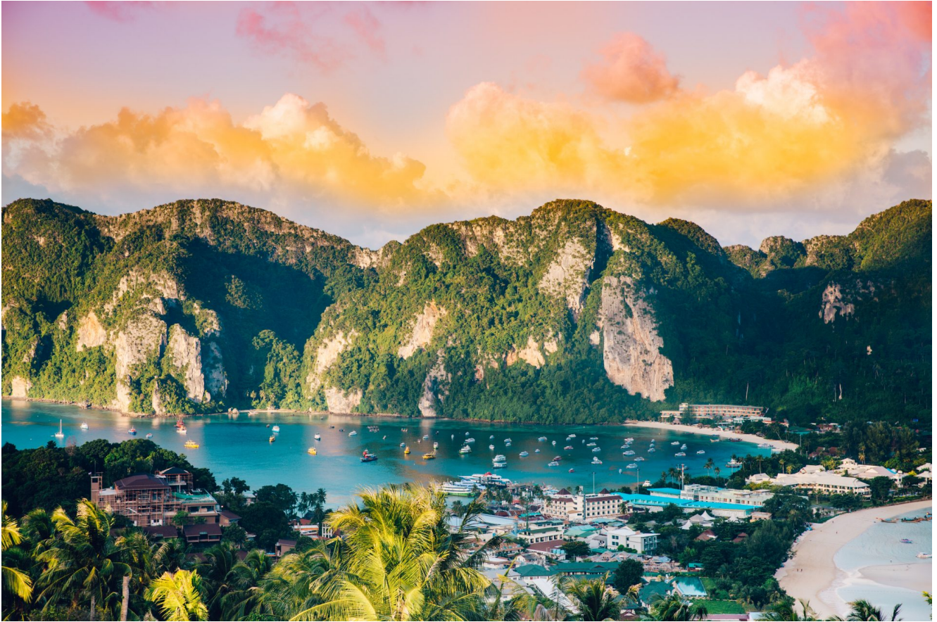
Phi Phi Islands, Thailand.

See the updates on Thailand's travel restrictions below: