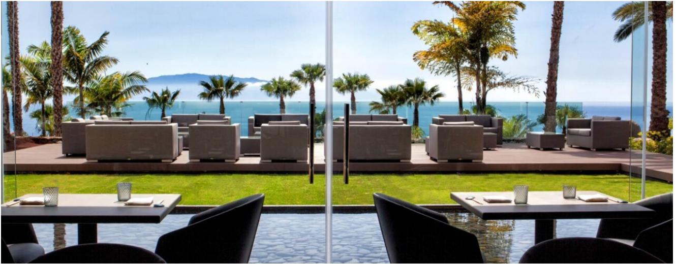
Kabuki Restaurant – Canary Islands