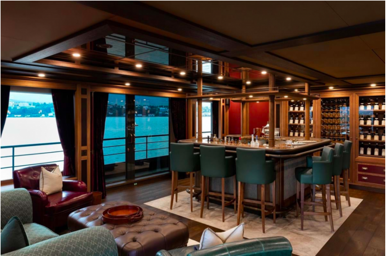
The main saloon.