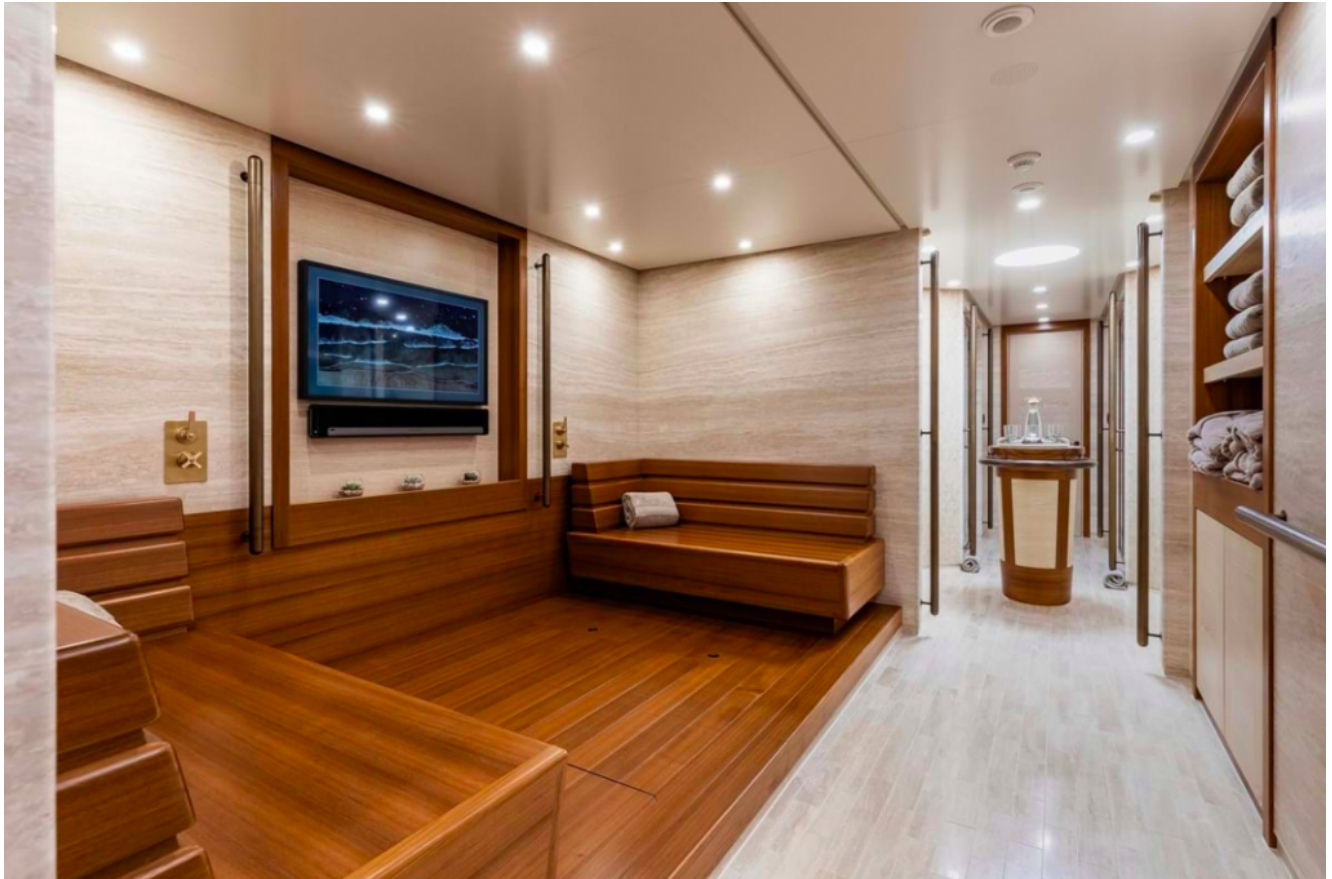
Ragnar's spa facilities.