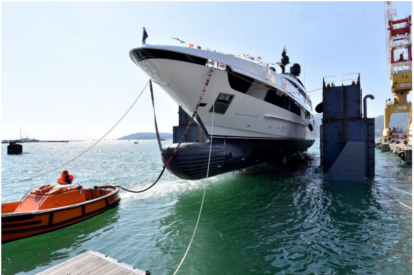
M/Y KD Launch

This constant pressure on the shipyard from the team was good. It meant no part of the build was overlooked, and the project stuck to the build schedule so it could be used for the summer as requested by the owner. KD was also shown at the 2018 Monaco Yacht show.