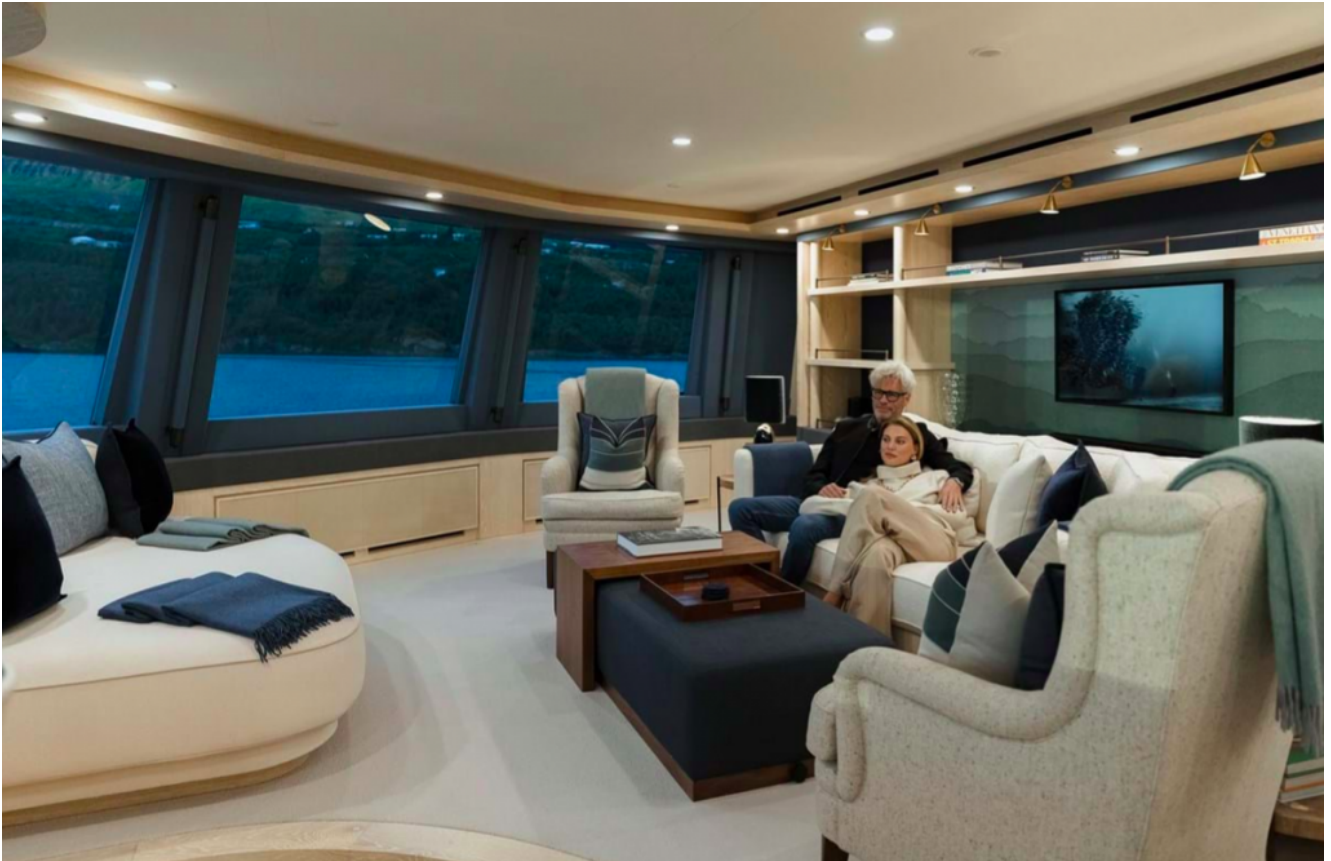
The observation lounge.