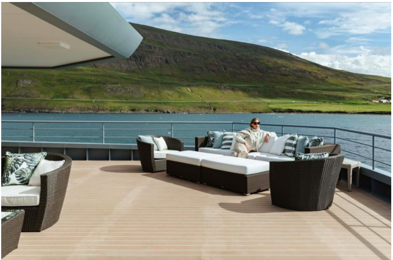
The lounging area on A-deck.