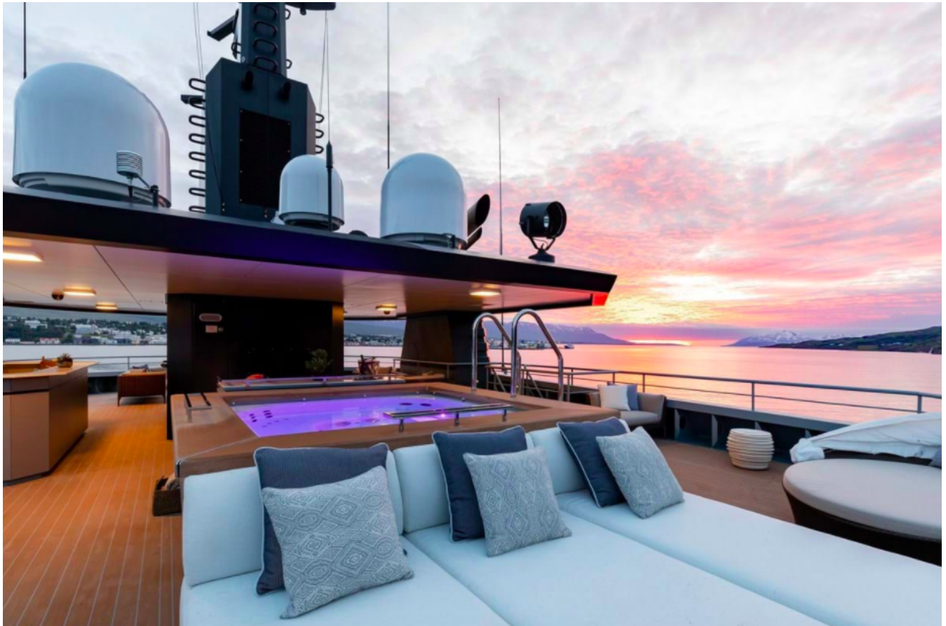
The top deck and jacuzzi.

Starting our tour on the very top, we can find an expansive outdoor living space. It's a place of tranquillity where guests can relax in the jacuzzi whilst enjoying the far-reaching views seen from atop the superyacht. Additionally, there is a bar and barbecue and plenty of seating areas to kick back and relax.