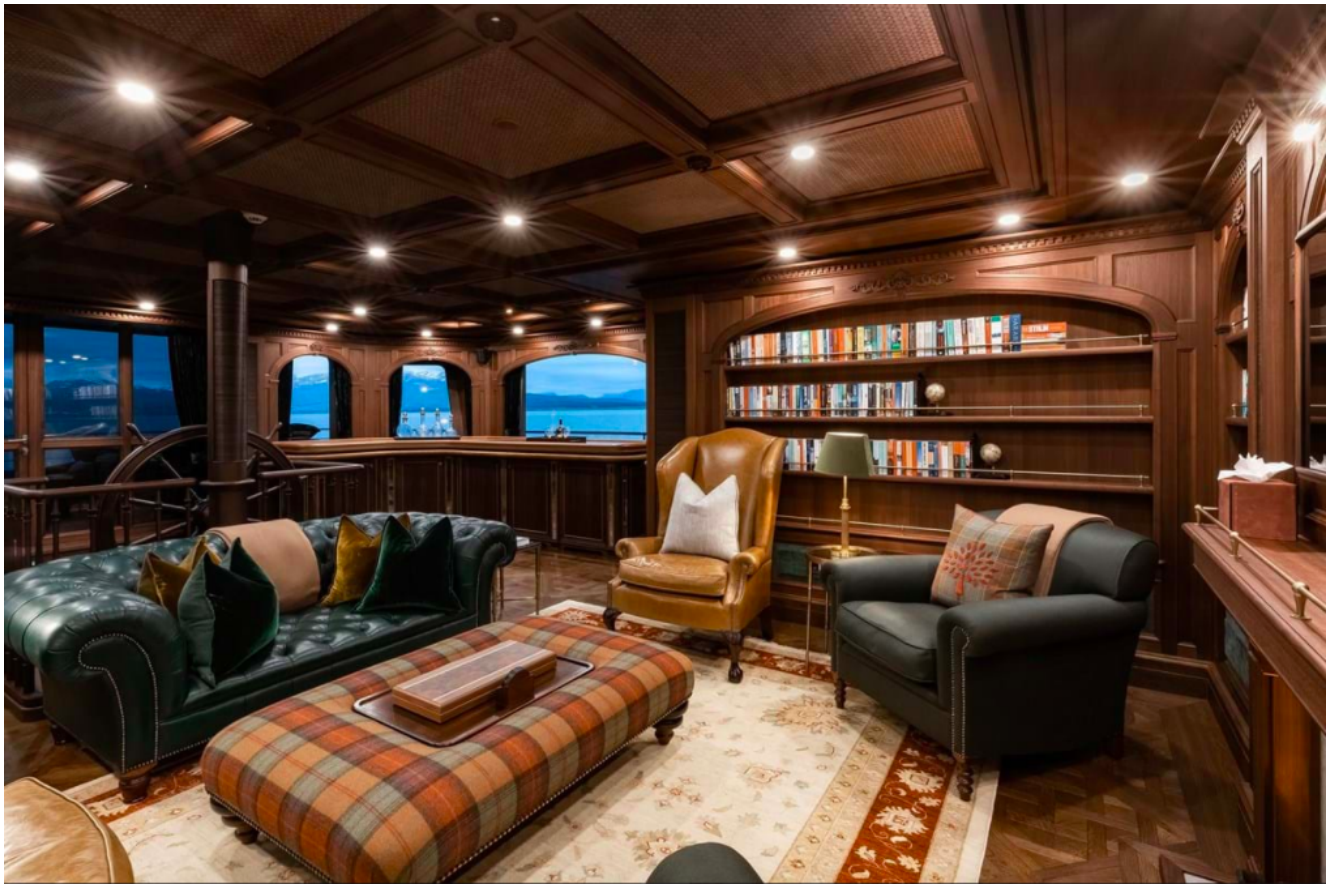
Sky Lounge.