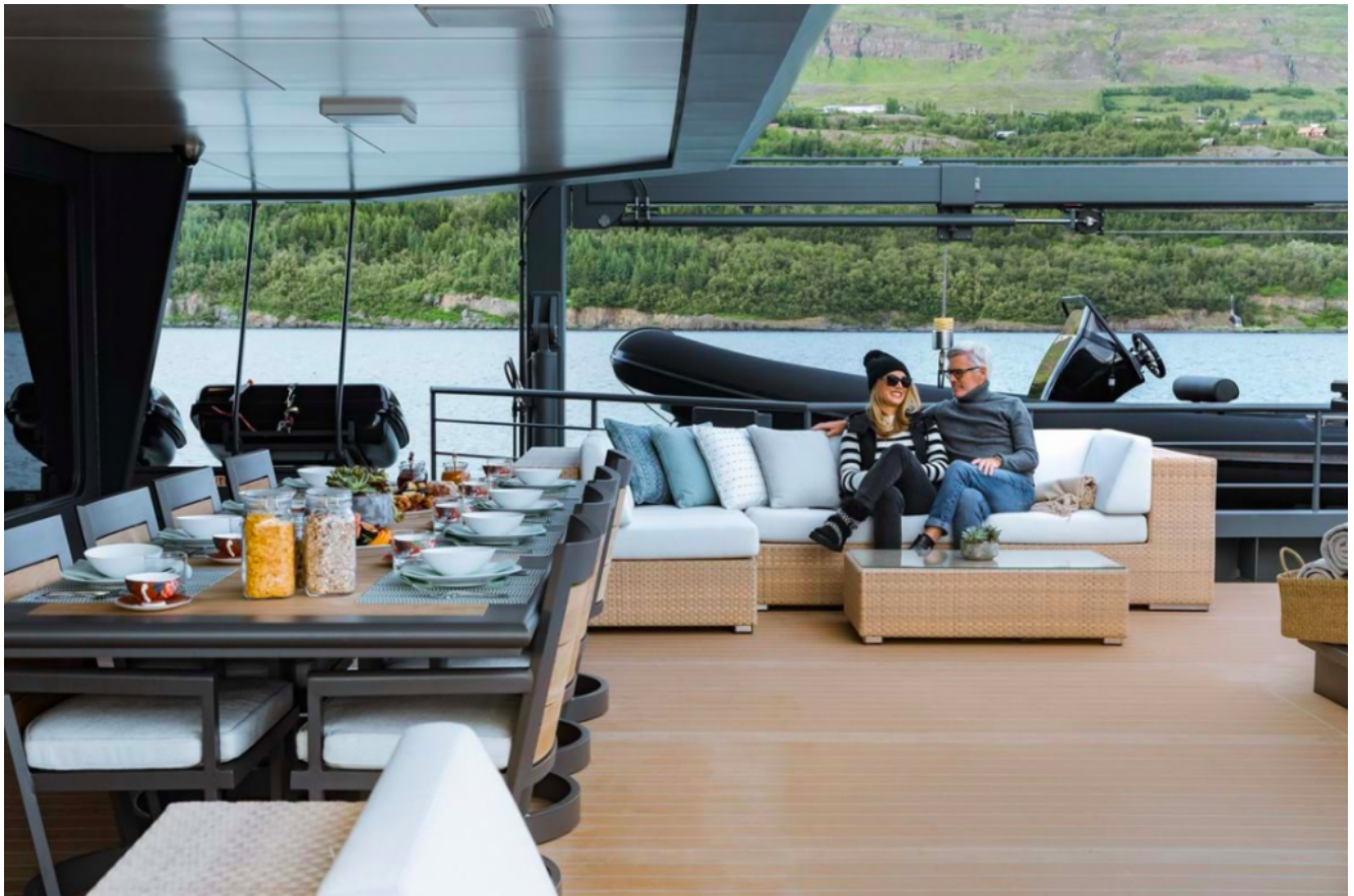
Main deck dining and lounging.

The outside space accommodates a more casual dining/lounging area and a luxurious pool.