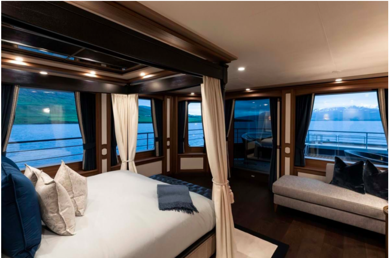
One of two master suites on Ragnar.

Descending to the vessel's upper deck, we can find two luxurious master suites. Complimenting the gorgeous bedrooms are lounging areas and en-suites, which incorporate themes found elsewhere on the superyacht. The wooden tub adds luxury and is in keeping with the interior throughout the vessel.