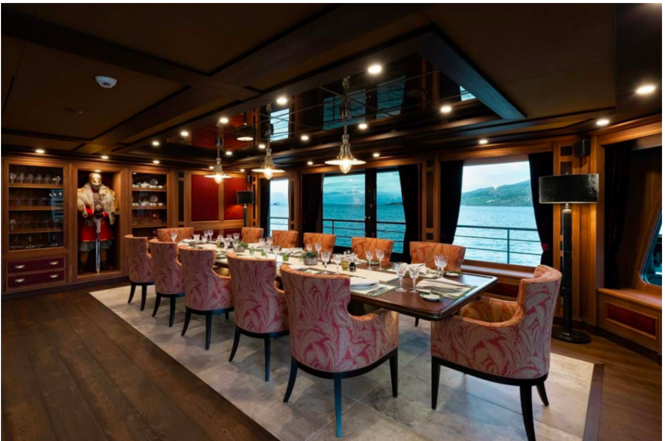
Ragnar's formal dining area.