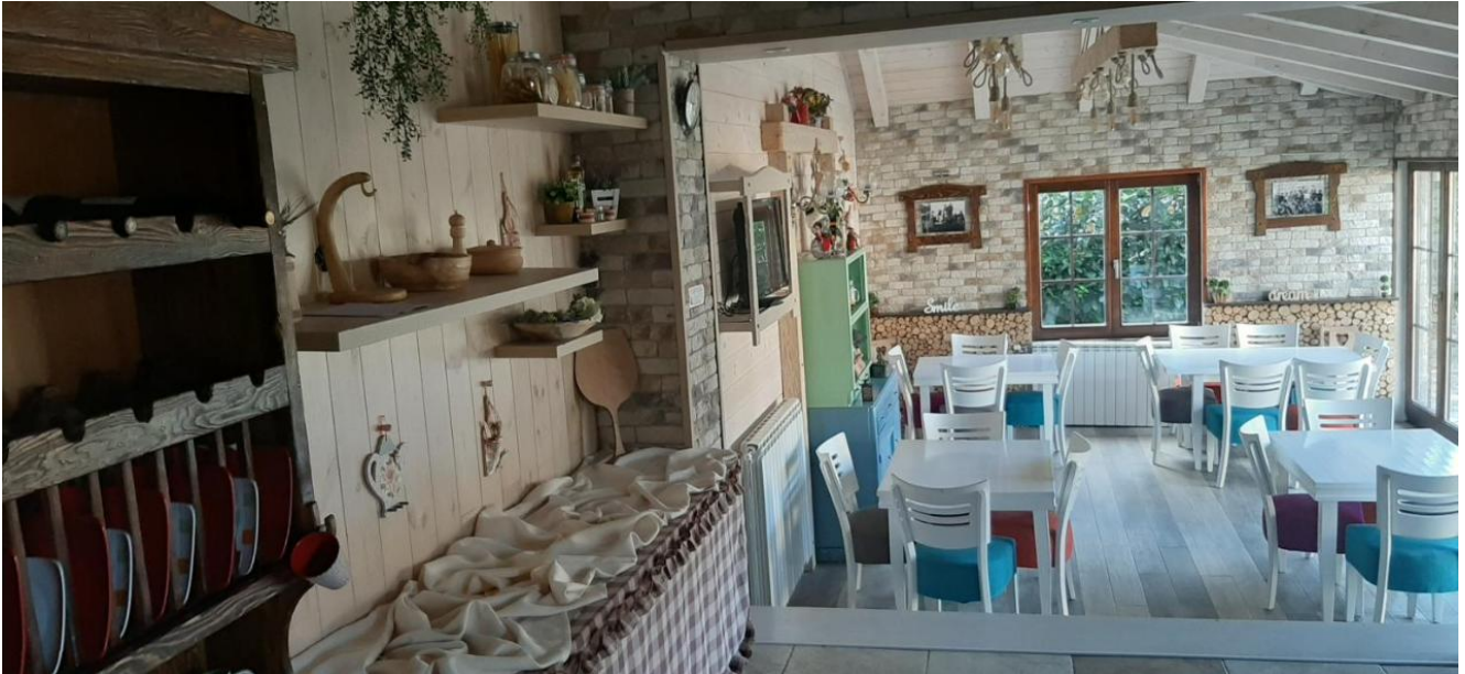
Accommodation- Mirovic Apartments Chalet