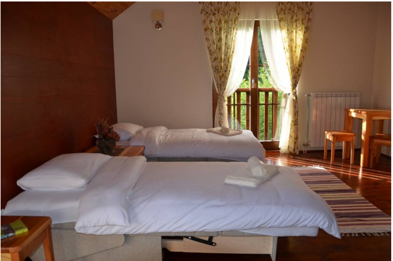
Accommodation- Mirovic Apartments Chalet

If you are based in Barcelona, Porto Montenegro has already booked in flights. The early-bird price is €350 , inclusive of flight and one night out in Podgorica, the capital of