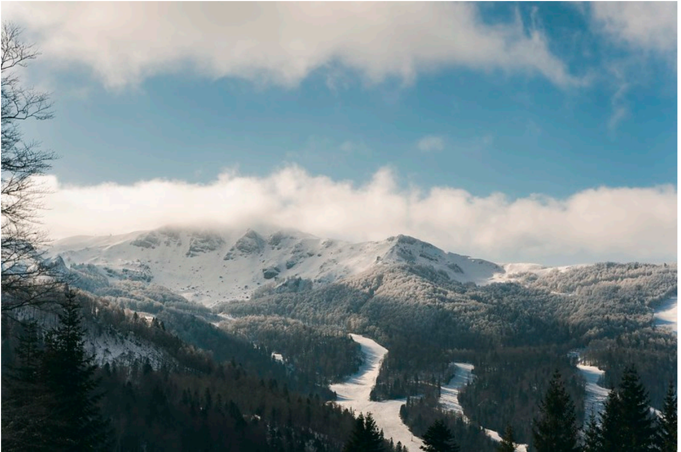
Bjelasica mountain in Kolasin