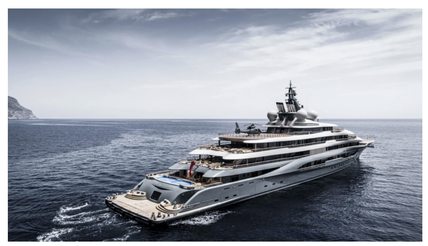
Flying Fox's stunning exterior.