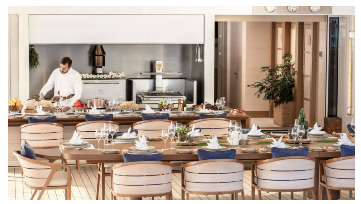
The dining saloon features an open kitchen layout.

sequestered using sliding screens). The dining area features an open, outdoor kitchen that allows guests to sit at the counter and watch the chef work, or at the extendable dining table.