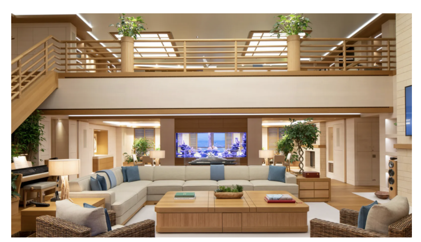
The leafy two-level saloon.

When it comes to social living spaces, the saloon found to Port on the Upper Deck is the perfect place for friends and family to gather. It's a leafy space, full of plants including two spectacular ficus trees. The lush plants are all on automated watering schedules to ensure they remain healthy. Bringing a sense of cosiness to the saloon is a real wood fireplace. It works like a typical fireplace, but with insulated ducts that route smoke up the mast with the help of forced extraction.