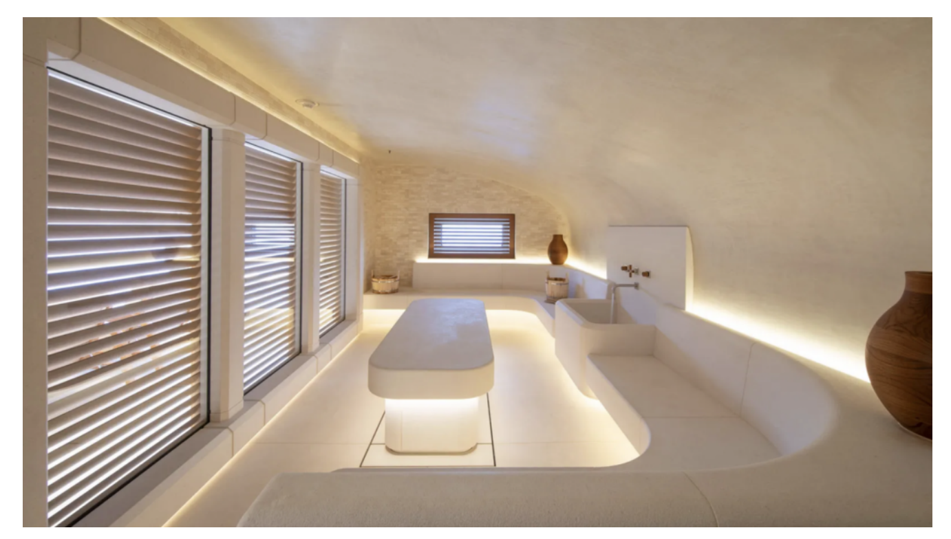
Flying Fox's calming Spa.

Perhaps the most breathtaking addition to the yacht is her spectacular pool. The 12-meter swimming pool, which runs transversely on the main deck, is a technological feat and a first for a superyacht of this size.