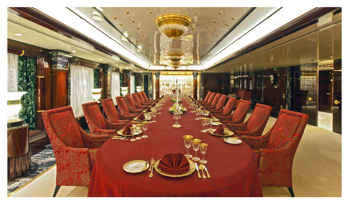
Lady Moura's dining room.

Lady Moura boasts a helipad, movie theatre, DJ room, indoor pool, spa with sauna, gym, owner's study and medical suites amongst her onboard amenities. She has two galleys, one for the owner and one for the crew, a bakery and separate owner/crew laundry facilities.