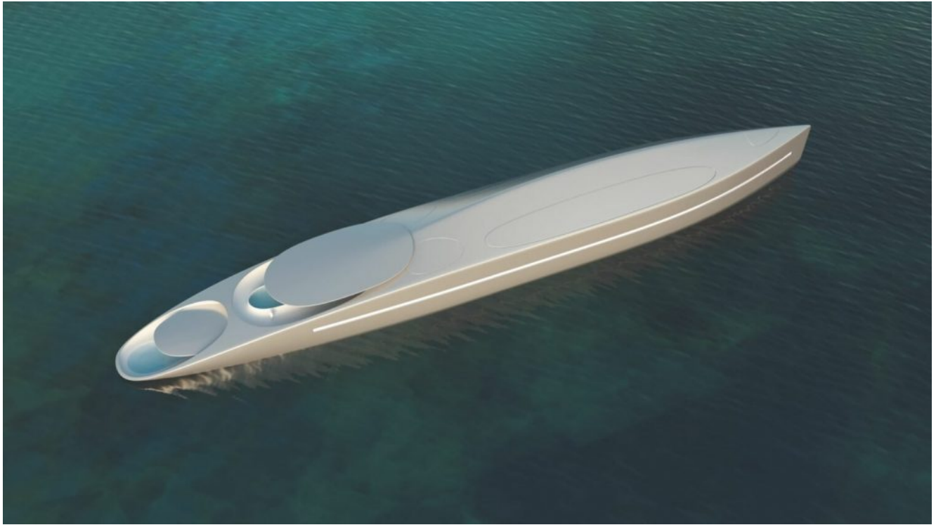
Project L. Photo: Thierry Gaugain

Thierry Gaugain's impressive superyacht concept Project L was recently listed for sale , so it's a matter of time before the spectacular vessel is snapped up. The 120m superyacht features a hybrid-propulsion system, alongside boasting a handful of other energy conservation features. The inclusion of a diesel-electric hybrid propulsion system with azimuthing thrusters fore and aft helps achieve fewer emissions. The superyacht also has a high-capacity waste management system to support her autonomy. In addition, she will glide through the water silently. This is due to her low drag and seamless lines, which ensure low noise and vibration.