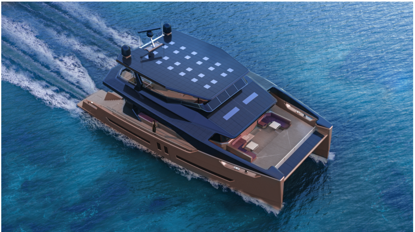
Ocean Eco 90.

Alva Yachts offer a wide range of eco-friendly yachts from the 15m eco-cruise 50 to their flagship model, Ocean Eco 90 which measures 27.5m in length. The Eco 90 is available as either fully-electric or hybrid-diesel propulsion. The cruising speed of the vessel is 8-10 knots, whilst the top speed pushes 16 knots. The vessel is designed to recharge quickly, to ensure owners can spend less time at standstill, and more time exploring. Alongside this, an exterior made to withstand all weather conditions makes the Ocean Eco 90 even more desirable for far-out excursions.