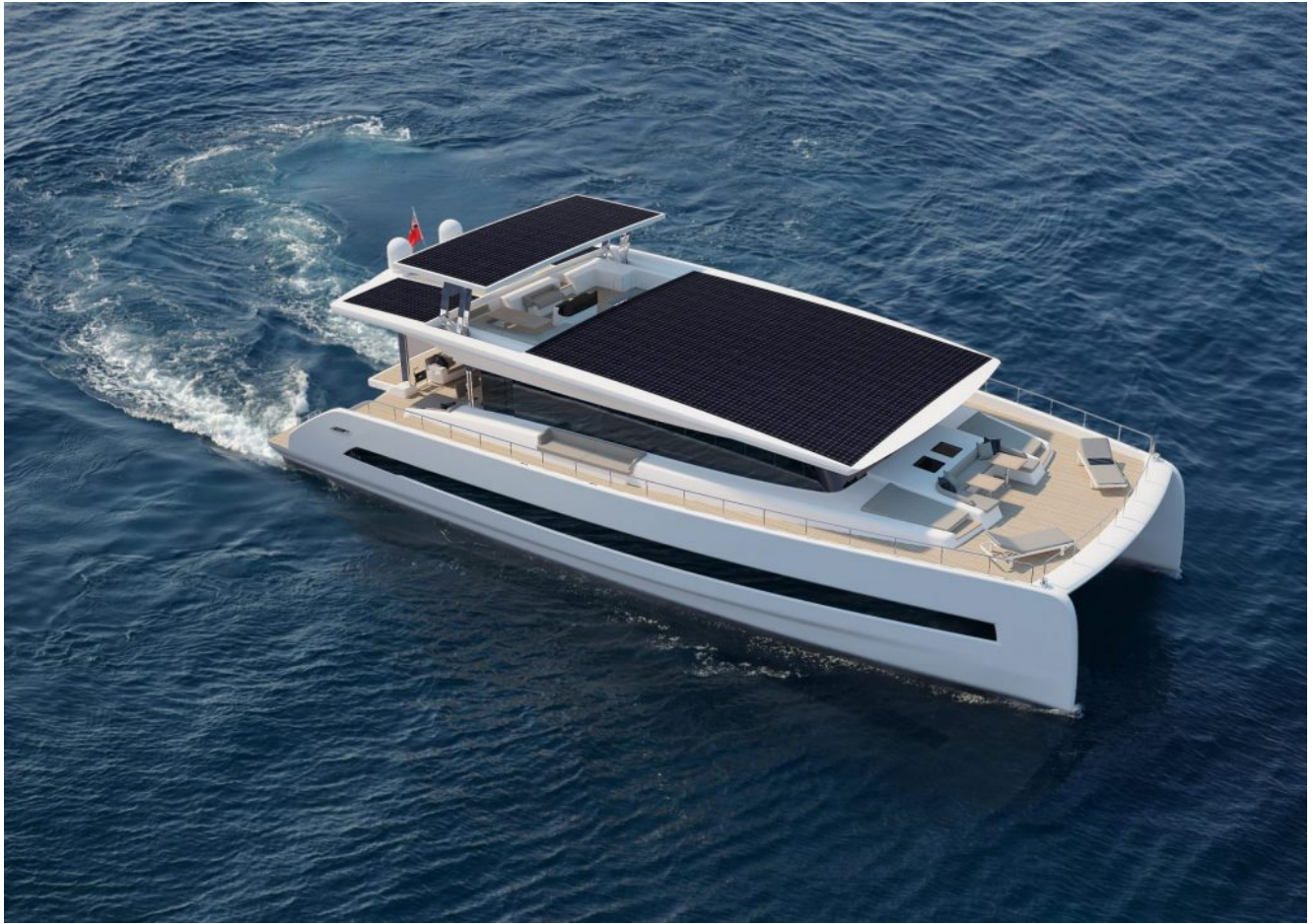
Silent 80.

Silent Yachts is one of the most prolific companies striving to deliver environmentally conscious vessels that do not sacrifice any luxury. The Silent 80, their flagship model represents everything they are trying to achieve as a company. With the 24m yacht contributing zero emissions whilst providing guests with peaceful noiseless cruising, the appeal of a guilt-free cruising experience is certainly easy to see. The slick design of the Silent 80 inspires visions of the future and what electric yachts could look like in the coming years.