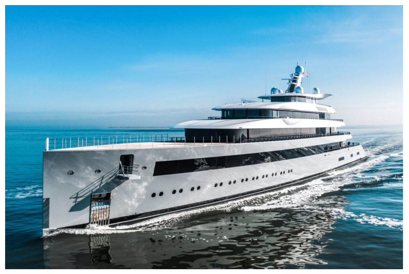
The mothership - 99.95m Moonrise.

<u>Compass Tenders</u> have shared photos of their latest tender delivery – a chase boat and landing craft duo crafted for Feadship's 99.95m MOONRISE. The 11.6m chase boat and 9.9m landing craft joined the mothership earlier this year and have already been put to use on an inaugural trip to Croatia.