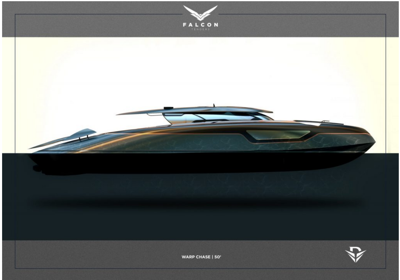
Designova Falcon Tender