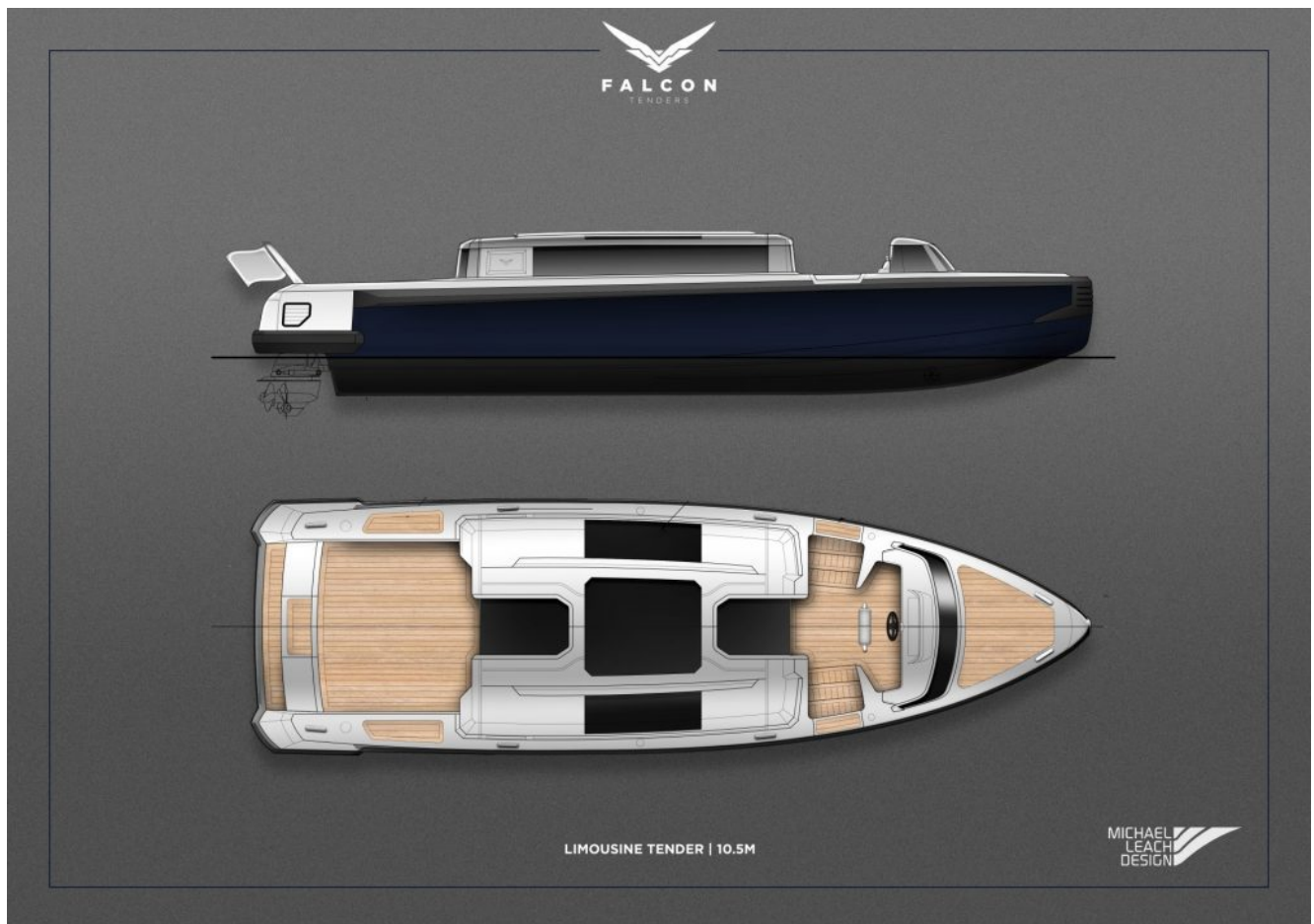
10.5m Falcon Limousine Tender

Falcon Tenders limousine is pitched at the upper end of the tender market. It has the perfect design for guests wishing to go comfortably from the yacht to shore best suited to yachts of 100+ metres that anchor further out at sea.