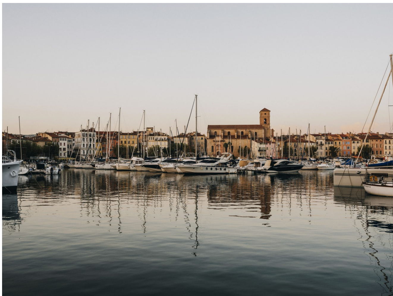
La Ciotat Vieux Port.