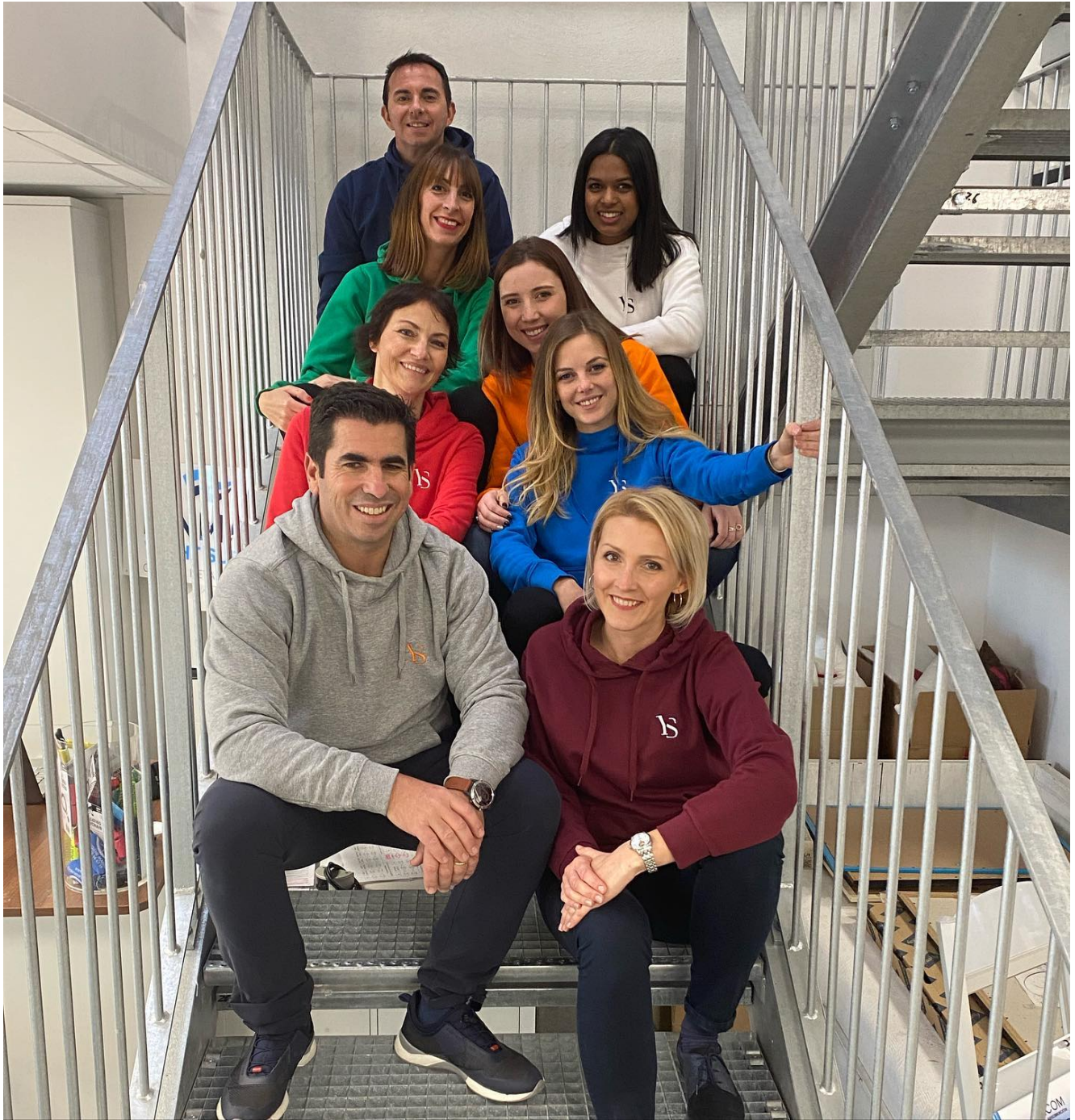
The Yachting Spirit Team in La Ciotat