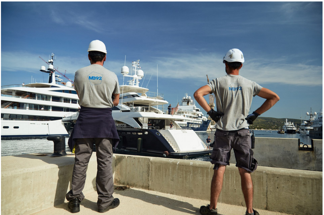
MB92 La Ciotat.