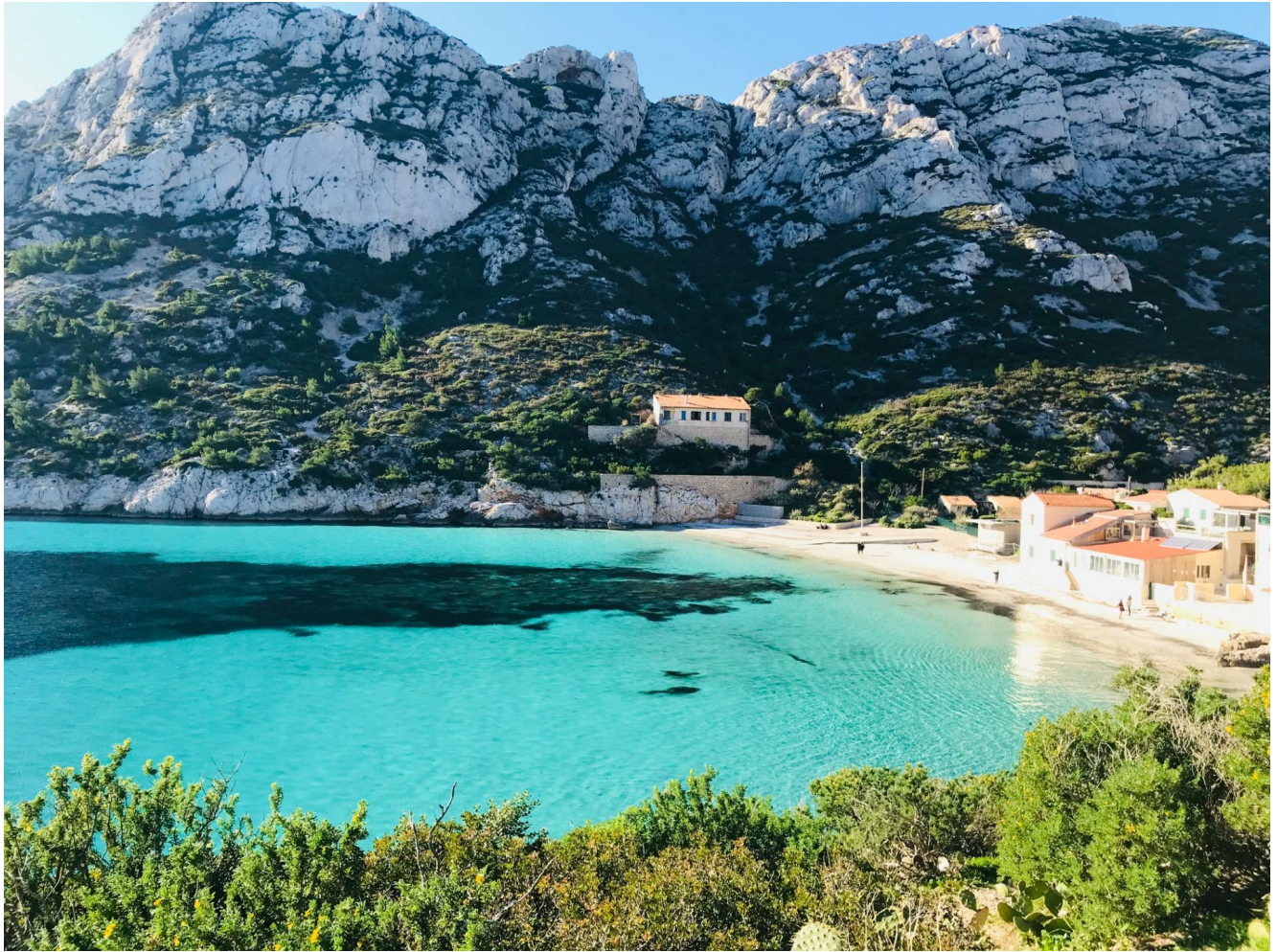
Calanque de Sormiou.

La Ciotat is well-positioned to continue as a leading refit and maintenance hub for the Mediterranean and it's proven there are plenty of places to see and things to do that appeal to locals and yacht crew alike.