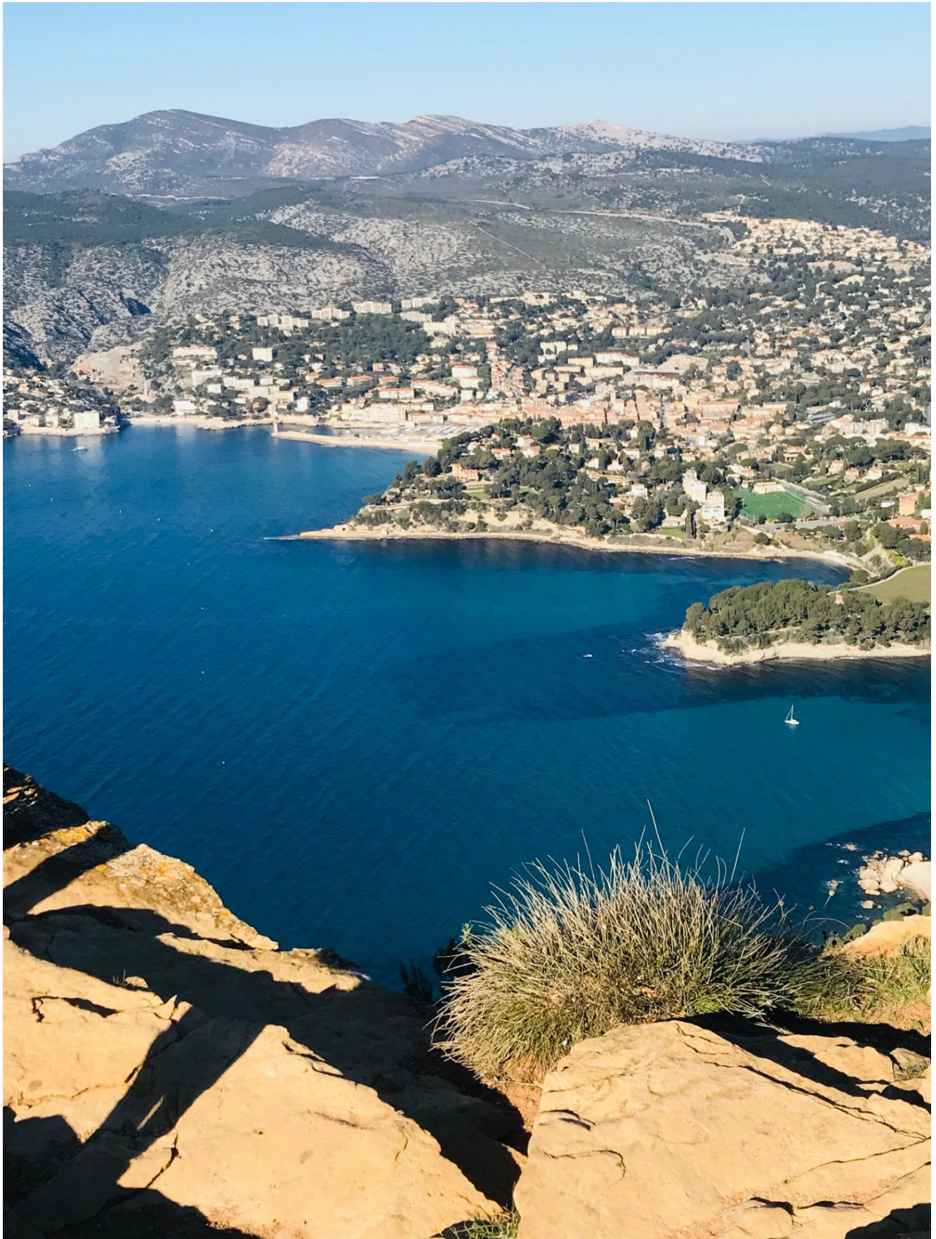
Route des Crêtes between La Ciotat and Cassis