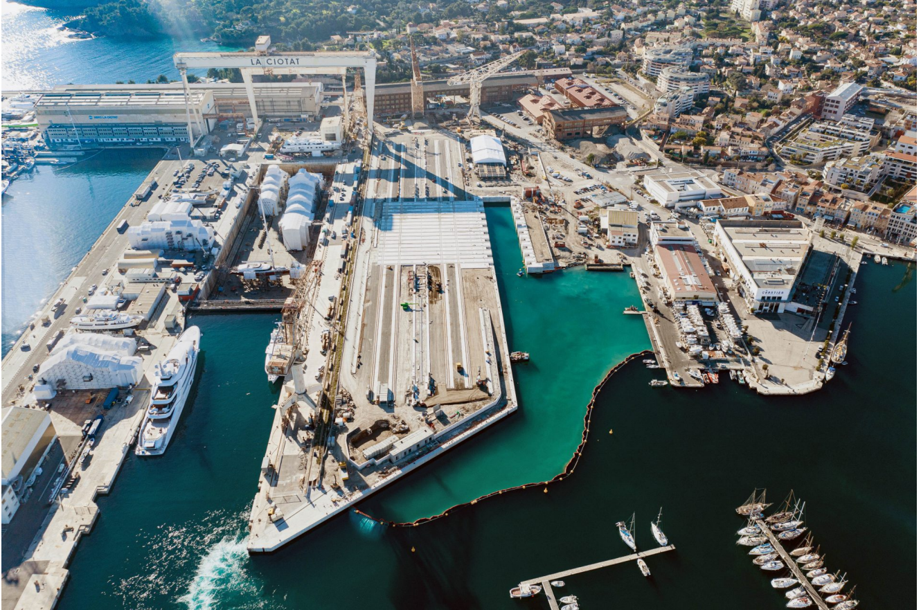
MB92 La Ciotat.

MB92 La Ciotat organises an exciting calendar of events and activities for crew both on and off-season, and they recommended these things: