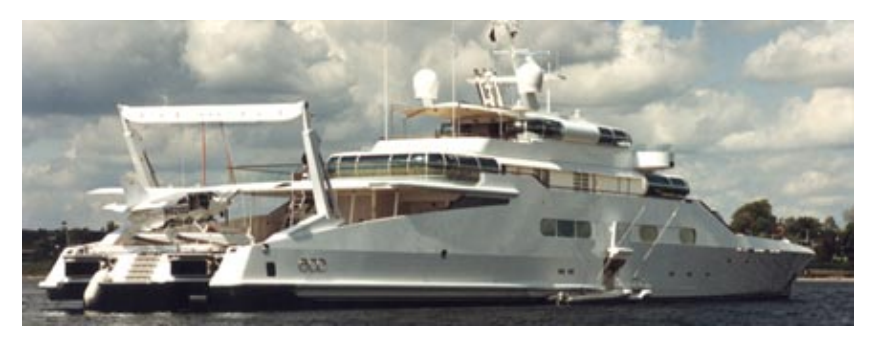
M/Y Enigma (ex. Eco) — 1991