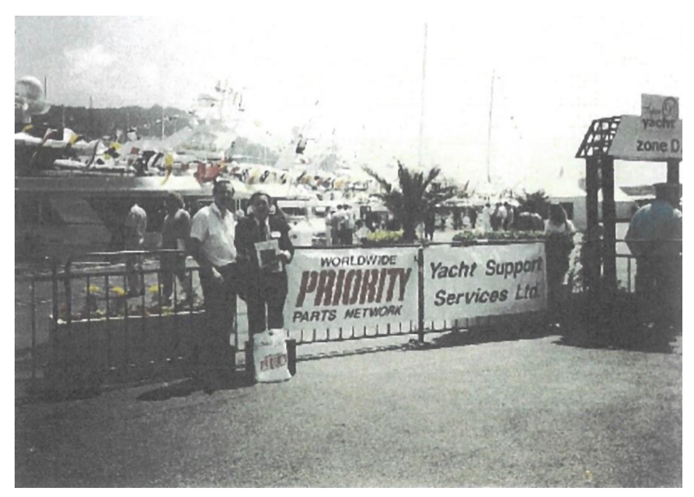
Word Wide Priority Parts Network - WPP