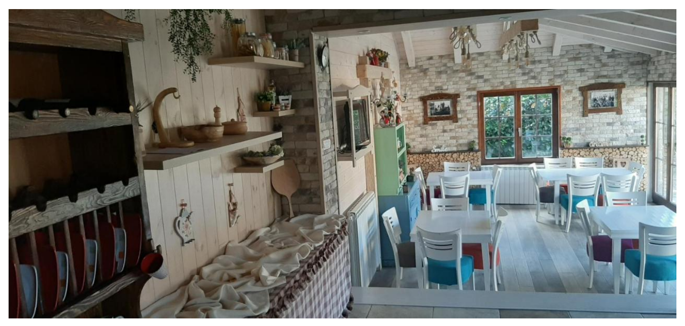
Accommodation- Mirovic Apartments Chalet