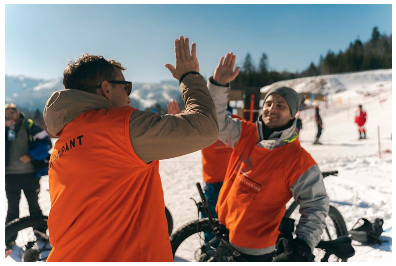
Porto Montenegro ACREW Superyacht Winter Games 2020