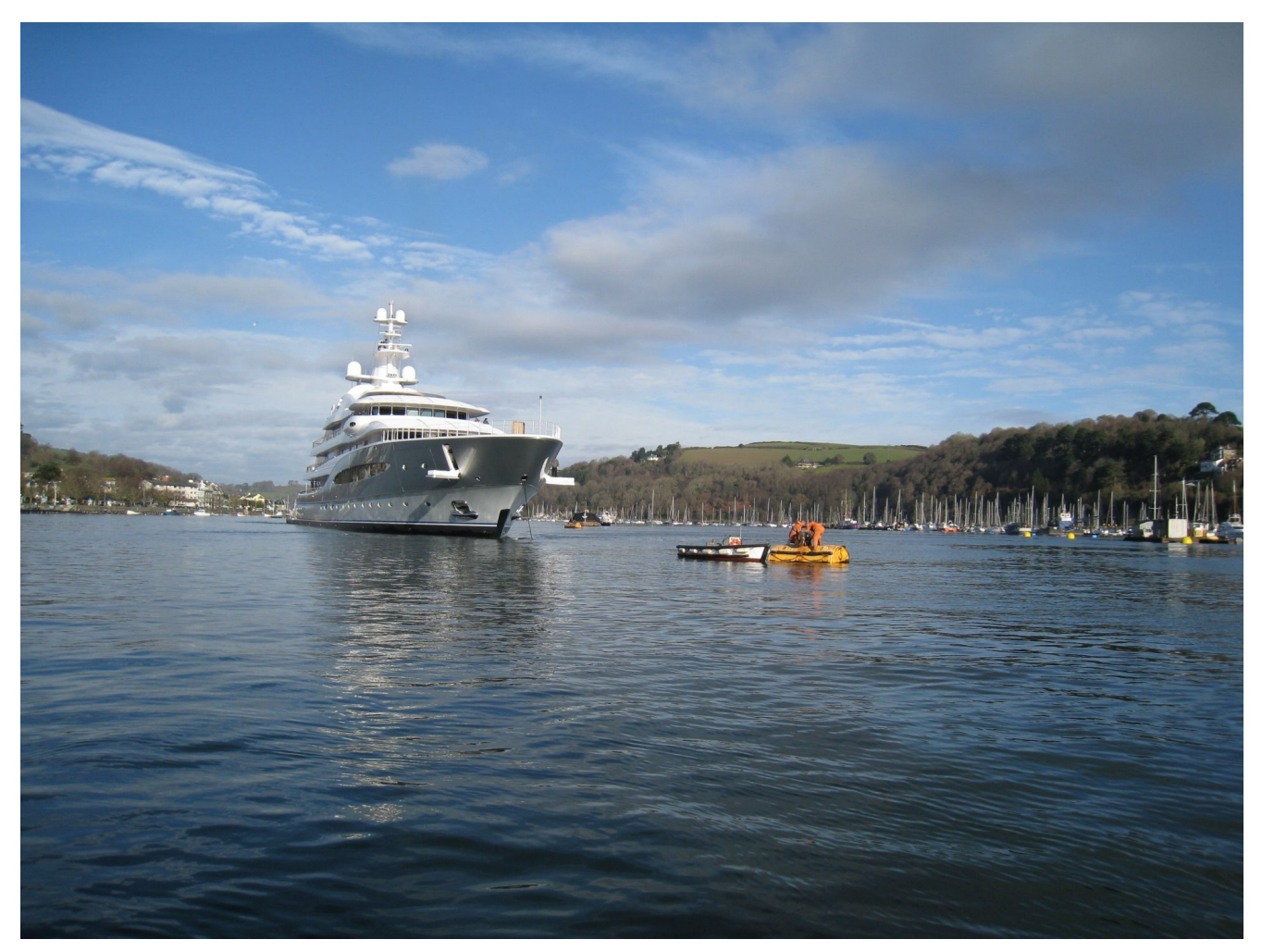
Mayan Queen in Dartmouth