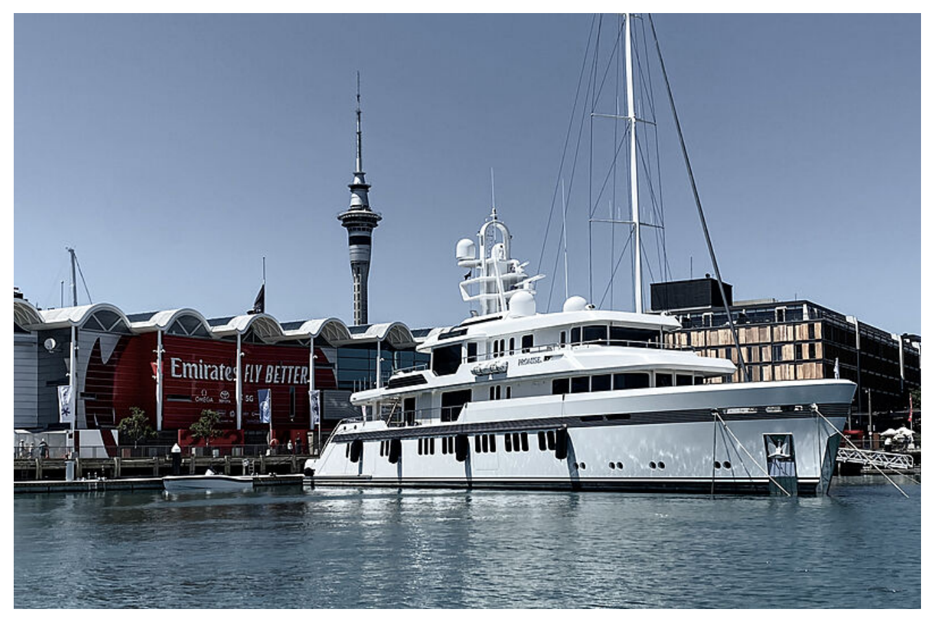
Auckland, New Zealand

Integrated Marine Group, New Zealand – New Zealand is a bucket-list destination for almost everyone. If you have the ambition to travel there and have a passion for yachting, you will feel right at home in this beautiful destination. Integrated Marine Group is a highly experienced team of marine professionals, providing support for every facet of your superyacht operational cruising program through to the most complex of refit or repair programs.